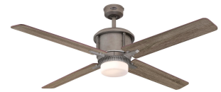
Reversible Pewter Ash Finish Blades