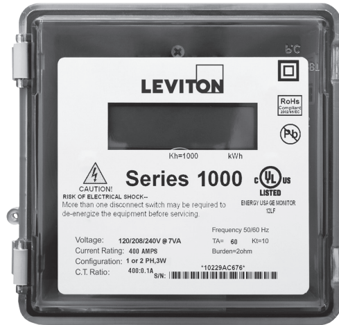
Outdoor NEMA 4X Enclosure