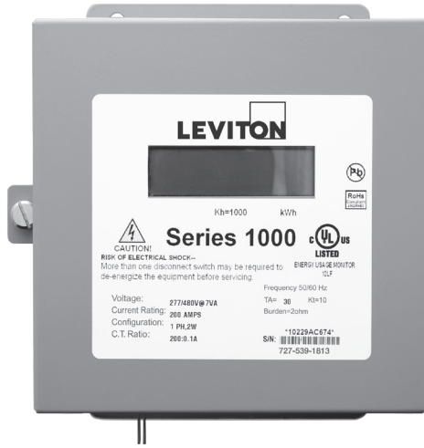
Indoor JIC Steel Enclosure