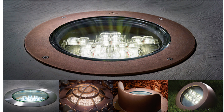
Lightvault8 Flat Frame, Stainless Steel, Rock Guard, Half Shield, Eyeball