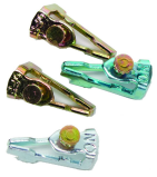
156T1978AMX 1 Set of ON/OFF Trippers for T100, T7000, and WH40