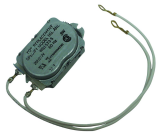
WG1573-10DMX 208-277 VAC, 60 Hz Motor for T102, T104, T106, T172, T174, WH40