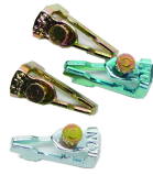
156T1978AD12 12 Pack of 156T1978A Trippers for T100, T7000, and WH40