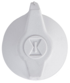
146MT577 Knob-Wall Switch FF Series - White