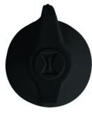
146MT579 Knob-Wall Switch FF Series - Black