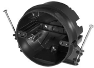
4" round new work non-metallic light fixture/fan box 4" diameter x 2-3/16" (102mm x 56mm)