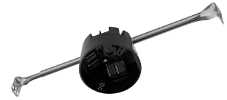
4" round new work non-metallic box with hanger bar assembly 4" diameter x 2-3/16" (102mm x 56mm)