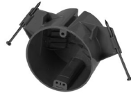
3-1/2" round new work non-metallic ceiling box 3-1/2" diameter x 2-3/4" (89mm x 70mm)