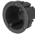
3-1/2" round old work non-metallic box 4-1/4" O.D. flange, 3-1/2" I.D. x 2-5/8" (108mm O.D., 89mm I.D. x 67mm)