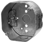
TP316 for non-metallic cable 4" x 4" x 2-1/8" (102mm x 102mm x 54mm)