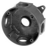
4" round surface mount box 4" diameter x 1-1/2" (102mm x 38mm) Requires SLD4RAD adapter

*This is a representative list of compatible junction boxes only. Information contained in this literature about other manufacturers' products is from published information made available by the manufacturer and is deemed to be reliable, but has not been verified. Cooper Lighting Solutions makes no specific recommendation on product selection and there are no warranties of performance or compatibility implied. Installer must determine that site conditions are suitable to allow proper installation of the mounting bracket in the box.