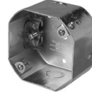
4" octagon light fixture/fan steel box 4" x 4" x 2-1/8" (102mm x 102mm x 54mm)