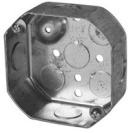
4" octagon steel box 4" x 4" x 1-1/2" (102mm x 102mm x 38mm)