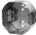
TP317 for metal clad cable 4" x 4" x 2-1/8" (102mm x 102mm x 54mm)