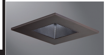
3011TBZBB Tuscan Bronze with Black Baffle