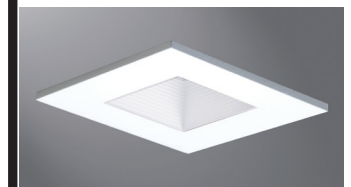
3011WHWB White with White Baffle