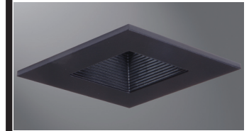
3011BKBB Black with Black Baffle