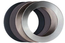
Field Installable Trim Kits: Black, Bronze, Copper & Brushed Nickel