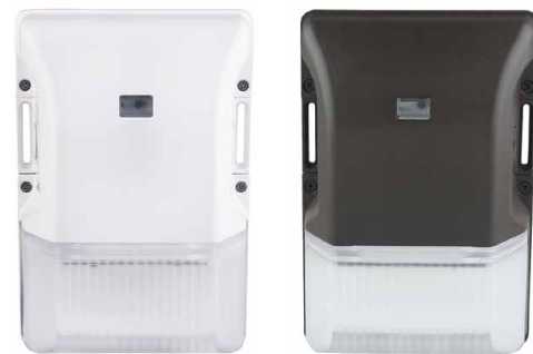
Available in Bronze or White Finishes