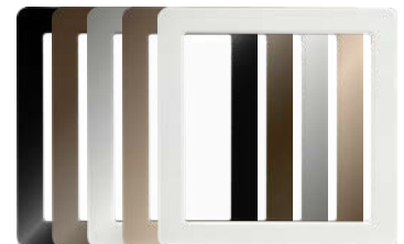
Field Installable Trim Rings Sold Separately: Black, Bronze, Nickel, Copper, and Field Paintable

Finishes: (ff)=(MW) Field Paintable, (BK) Black, (BN) Brushed Nickel, (BZ) Bronze, (CP) Copper