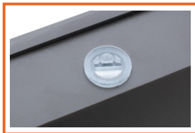
Optional Photocell Dusk to Dawn