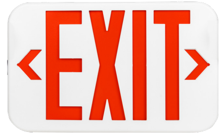
Single or Double Face (both plates included)