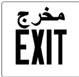
SW65 (Makhraj Arabic)