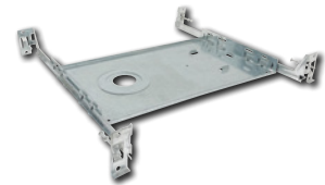
NF-R124 Universal New Construction Frame-In