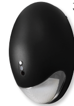
NE-921LEDBCC Black Finish

Three position sliding switch 3000K / 4000K / 5000K