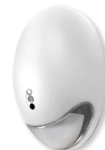
NE-921LEDWCC White Finish