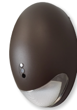
NE-921LEDBZCC Bronze Finish