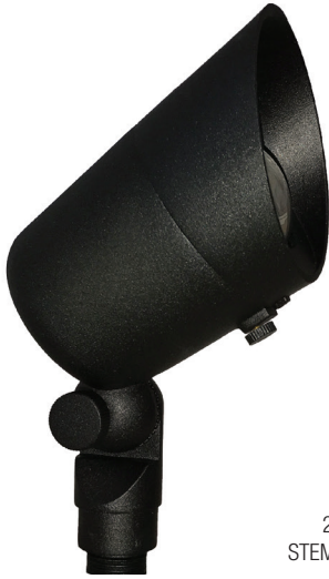
SHOWN IN BLACK FINISH (ALSO AVAILABLE IN BRONZE FINISH)